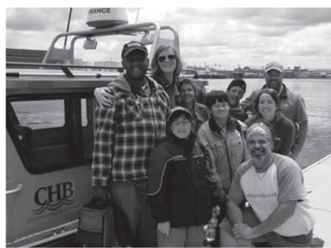
Boat ride with Citizens for a Healthy Bay